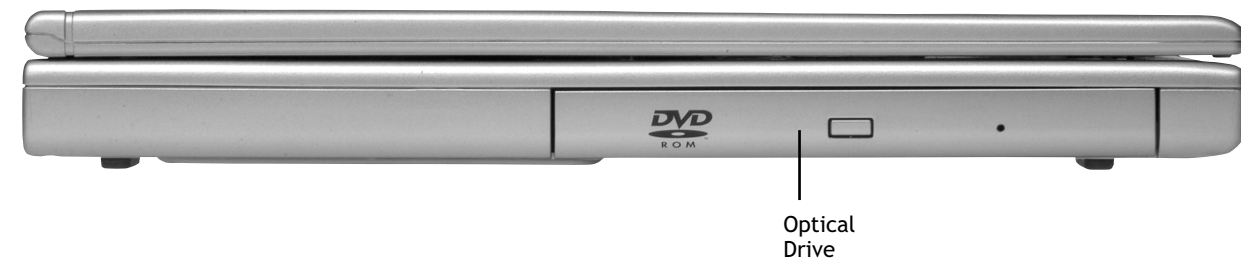
Left Side View of the WinBook W